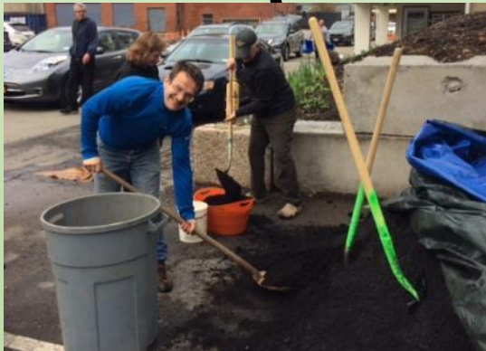
Residents picking up compost at Compost Giveback Day