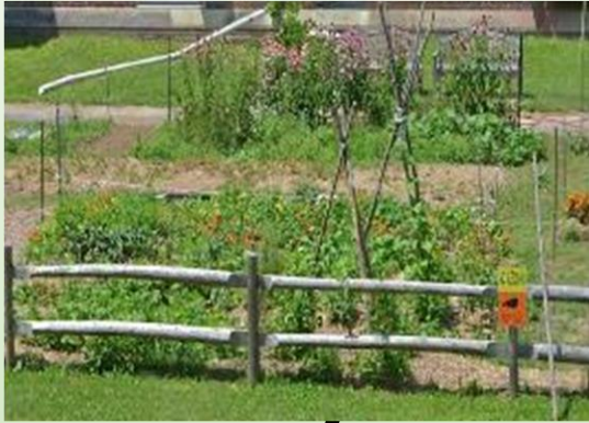
Compost from our Food Scraps used on our Gardens