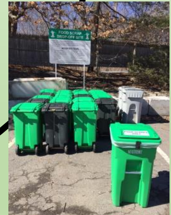
Food Scraps Ready for Pickup