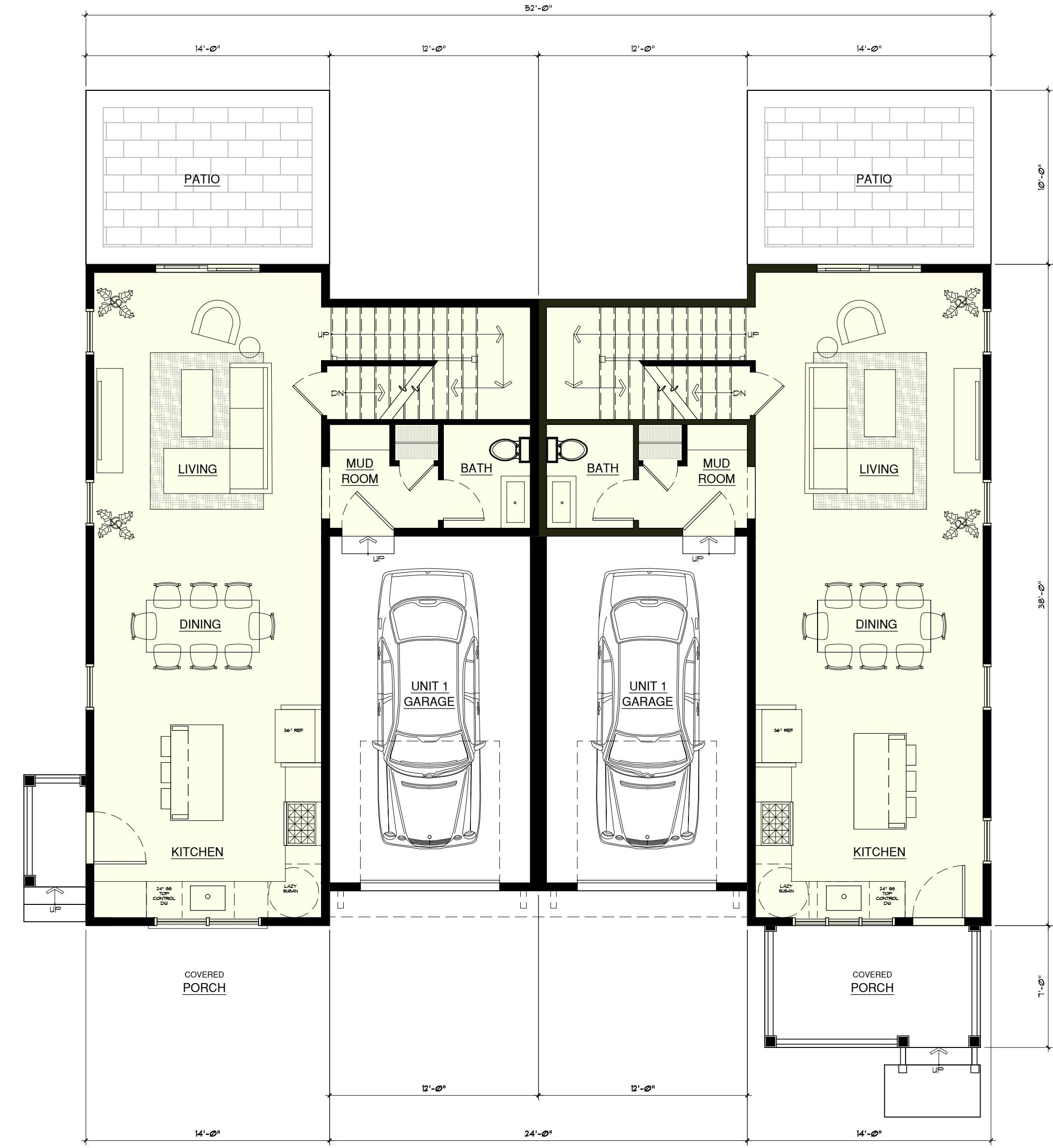
1 Lot 1- First Floor Plan (1,890 Gross SF- 1,390 FAR) A1.01 Scale: 3/16" = 1'-0"